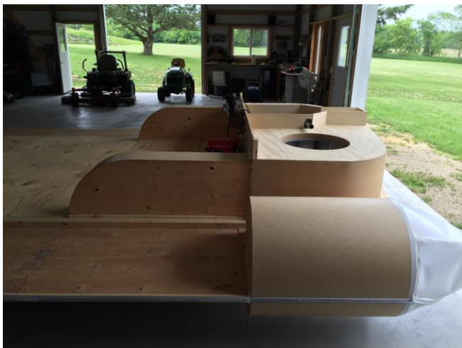
Lift fan section fitted to an additional 16 feet of test platform.