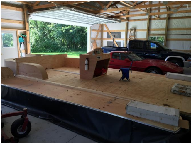
Test platform with skirt attached and control console for motor controls and pressure indicators for bag and lift PSI.