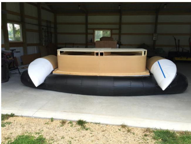
Front view floating on bag skirt.