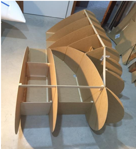
Skirt template for rear quarter shown upside down.