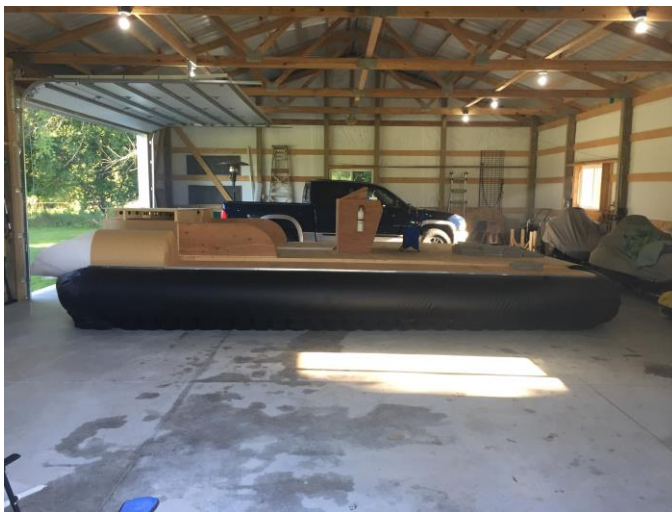
Test platform floating with finger sections attached to the bottom of the bag skirt.