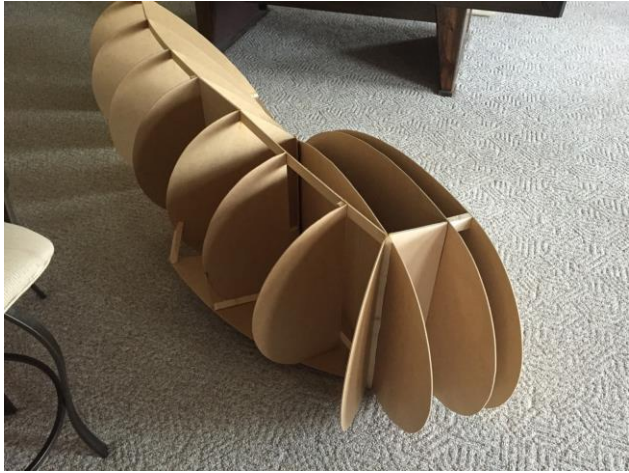
Front quarter section skirt template shown upside down.