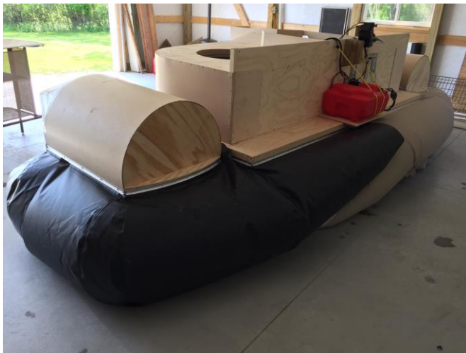
Test fit of production 18oz . fabric produced from patterns. Rear Quarter.