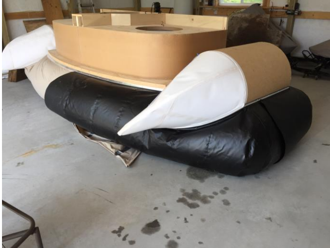
Test fit of production 18oz . fabric produced from patterns. Front Quarter.