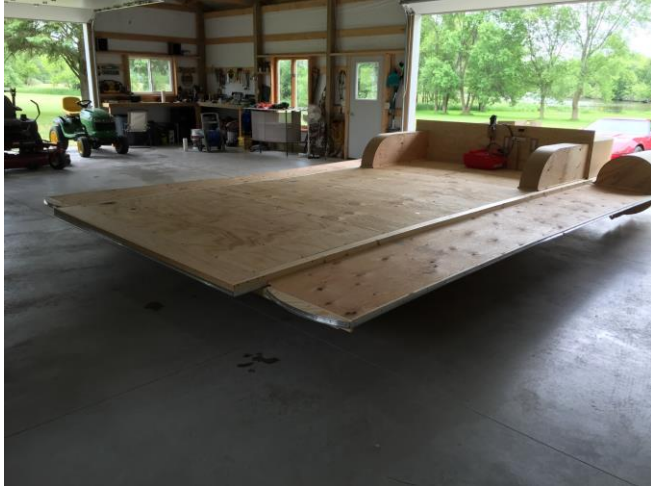
Full scale test platform. 20 feet, 8 inches.