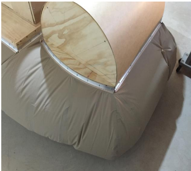
Light weight vinyl skirt lifted from the pattern to test for fit. Inflated with 1 HP electric motor and mock-up lift fans.