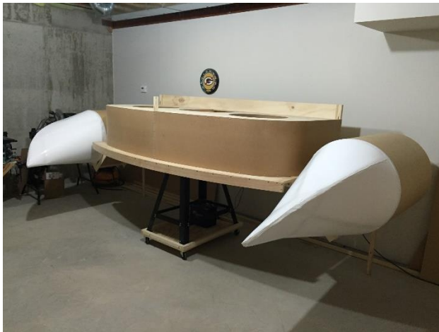
Lift Fan housing with pontoons deployed.