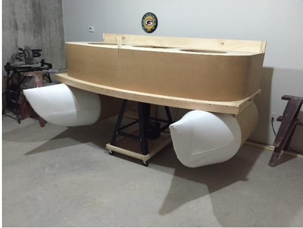
Lift Fan housing with pontoons retracted.