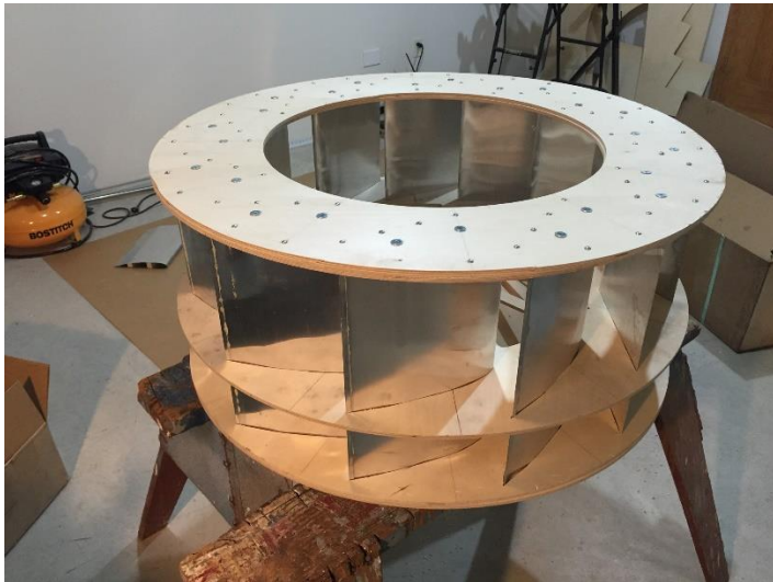
Plywood mock-up with 12 airfoils