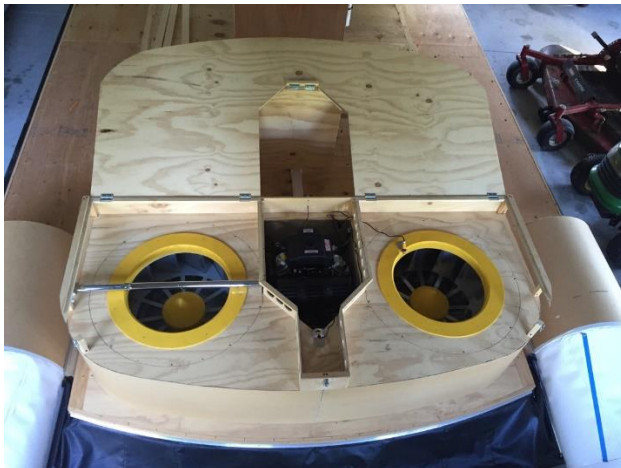
Lift Fan system installed on test platform.