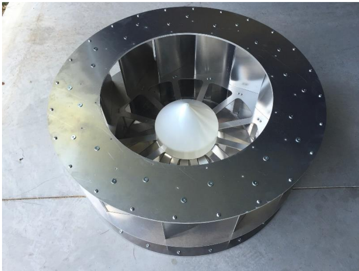
Production laser cut lift fan.