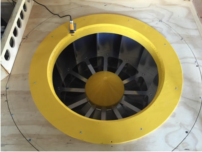
Lift Fan using IR sensor to detect fan RPM.